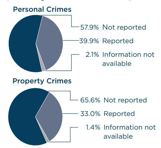
Figure 2. Victimizations Reported to the Police (Percentage of total victimizations)

Note: Percentages may not add to 100 due to rounding.