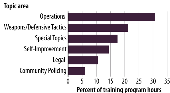
FIGURE 1 Topic areas of basic law enforcement training programs, 2022

Note: See table 2 for all subjects within each general topic area of basic training curriculum. See appendix table 1 for estimates and standard errors.